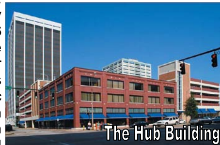
The Hub Building

The property consists of 51,000 SF of office and retail space, 426 parking spaces in a structured garage and 200 surface spaces. The second building is known as the Miller Building located at 629 Market Street; this property is over 153,000 SF and is on the National Historic Records. BlueCross selected NAI Charter to team with Staubach due to NAI Charter's marketing platform and its successful relationship with BlueCross and Staubach. For more information, please contact David DeVaney at NAI Charter.